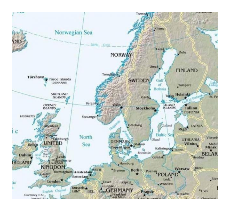
Map 2. Norden in a North-European perspective